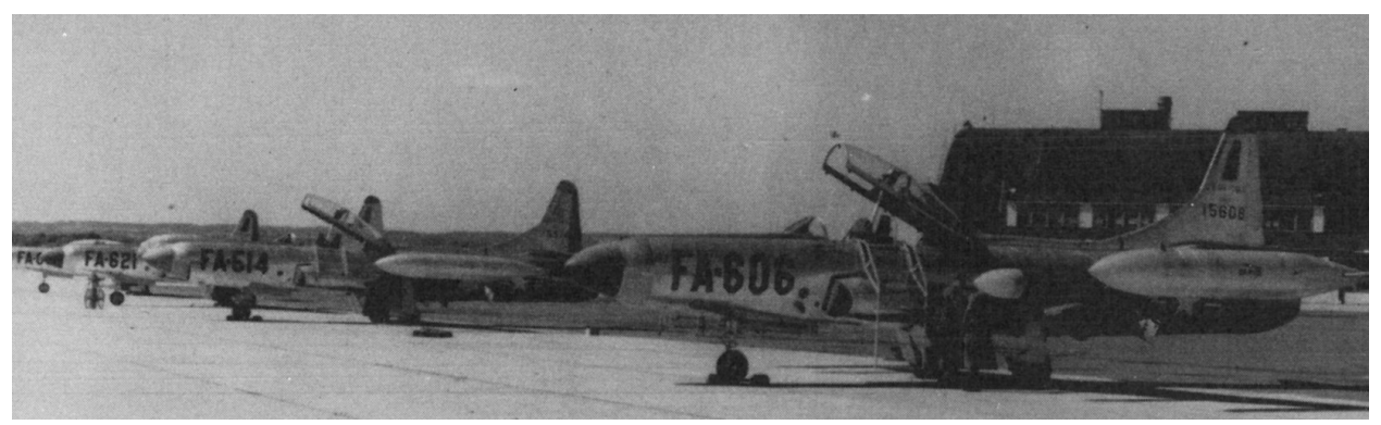
F-94s on the flightline

The 332nd FIS activated at New Castle County Airport, DL on March 27, 1953 after being reconstituted six weeks previously. Originally assigned to the 329th Fighter Group during WWII, the squadron was assigned to the 525th Air Defense Group upon reactivation, but was reassigned to the 4709th Air Defense Wing on August 18, 1955 when the squadron's designation was transferred to McGuire AFB and they became a F-86D squadron. All but four of their F-94Cs had come directly to them from Lockheed, and upon the move to McGuire AFB, twelve of these were transferred to their replacement squadron at New Castle County Airport, the 97th Fighter Interceptor Squadron.