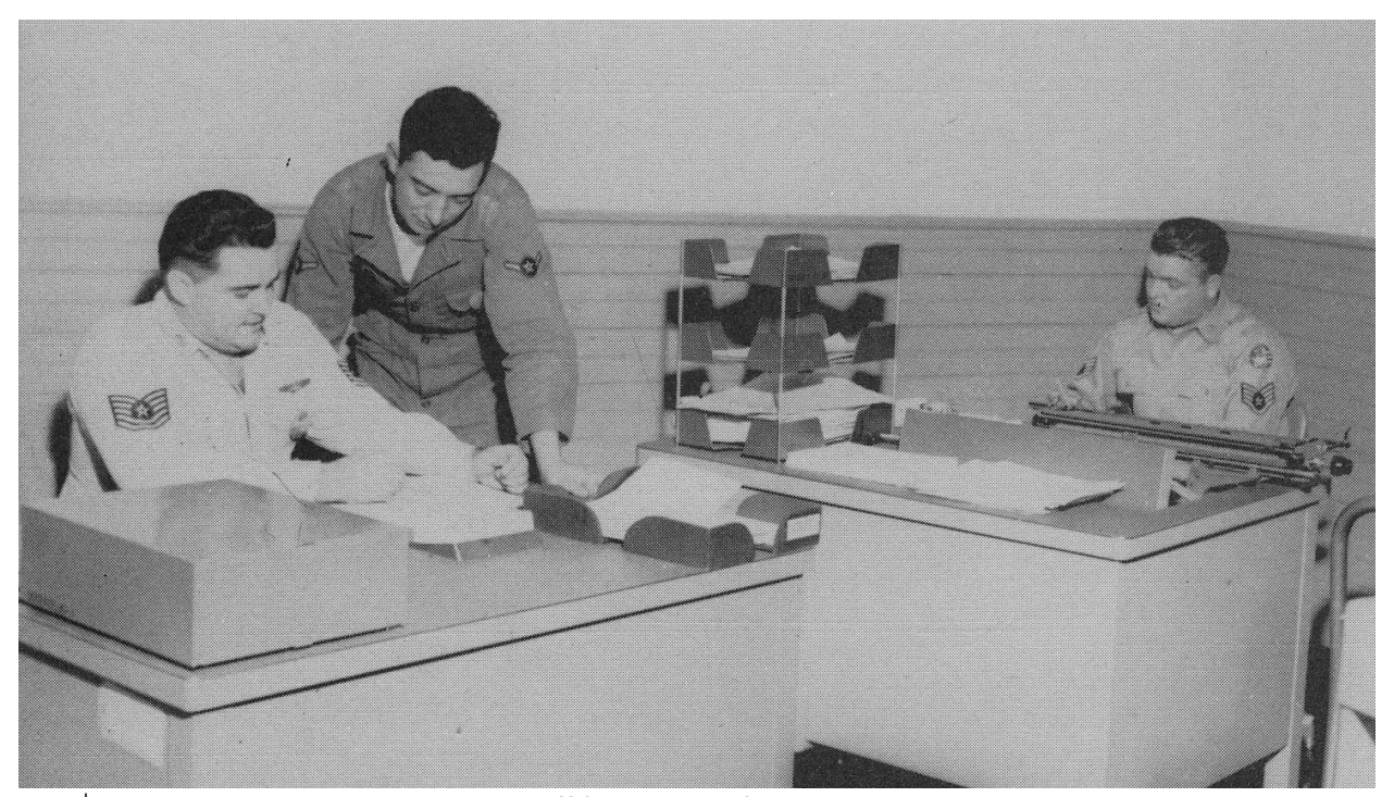
332<sup>nd</sup> First Sergeant and orderly room staff

Air Force Order of Battle Created: 3 Nov 2011 Updated: 17 Jan 2014