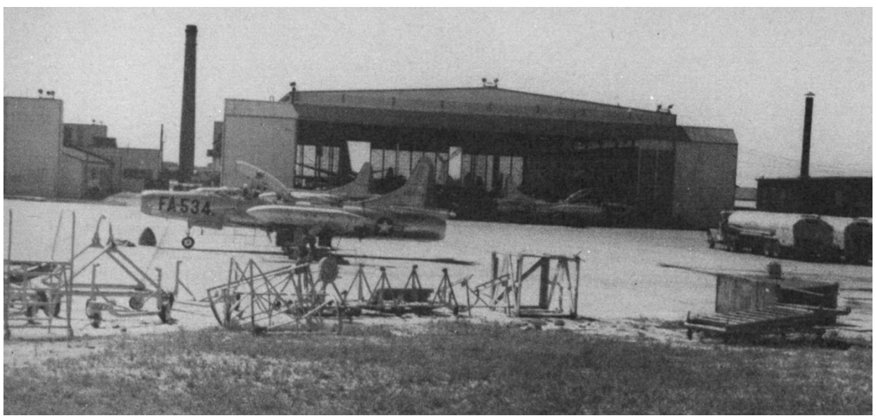
F-94 and maintenance hangar